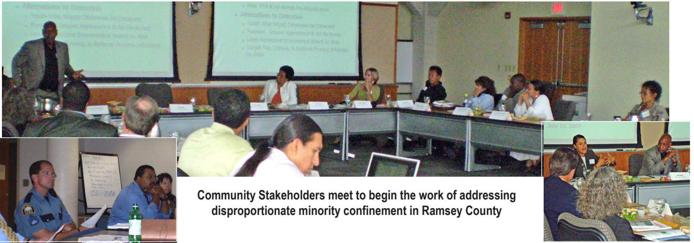
Community Stakeholders meet to begin the work of addressing disproportionate minority confinement in Ramsey County